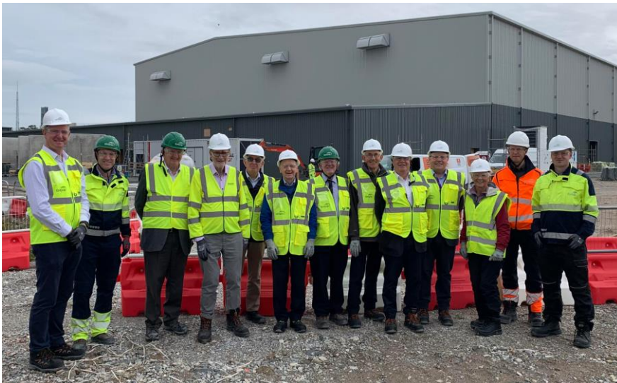
Site visit kindly hosted by Eirgrid team

The site visit included the Ballyadam onshore convertor station (under construction) with a major convertor hall (in the background to the group photo) and spares building. The subsurface conditions at Ballyadam were challenging, with Boulder Clay underlain by Karstic Limestones.