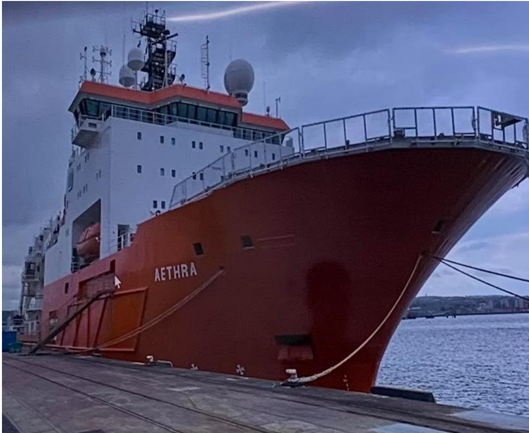
Marine pipelaying vessel AETHRA

The site visit included the Ballyadam onshore convertor station (under construction) with a major convertor hall (in the background to the group photo) and spares building. The subsurface conditions at Ballyadam were challenging, with Boulder Clay underlain by Karstic Limestones.