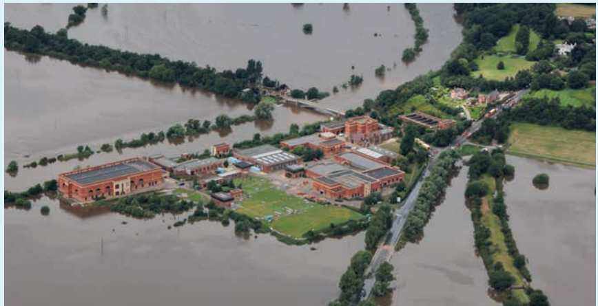
Mythe Water Treatment Works in Tewkesbury, England, flooded in July 2007, leaving 350,000 households without clean water for 17 days. Unless we act now, disasters such as this could become more common, as intense rainfall in future could pollute drinking water.