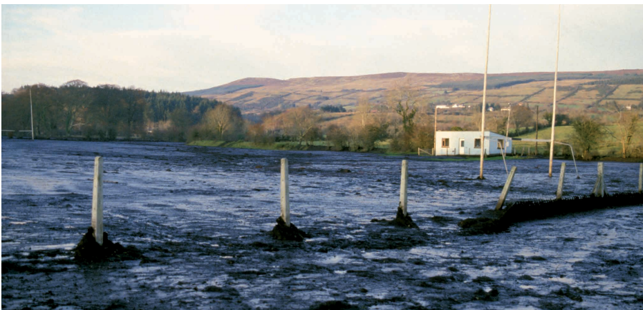
Geevagh, Co Sligo: we are already experiencing an increase in bog slides, similar to the one which inundated these sporting facilities.

coastal warning system. Modern technology, including GIS, should be used to capture and disseminate the data; using altimetry would minimise the number of gauges required.