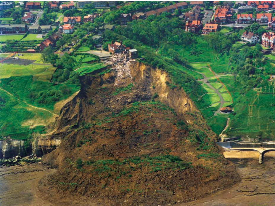
Changing rainfall patterns could increase the risk of landslides: heavy rains and local geology combined to trigger this landslide, which destroyed the four-star Holbeck Hall Hotel in North Yorkshire in 1993.

in relation to the quality of their water supplies and prepare contingency plans to deal with unexpected pollution events. The existing sewerage infrastructure was not designed to cater for the more intense rainfall we expect in future and which is likely to overwhelm parts of the network, causing local flooding and polluting water sources. We could also see more soil and peat erosion, landslides, and the spread of agricultural pollutants, all of which would damage water quality.