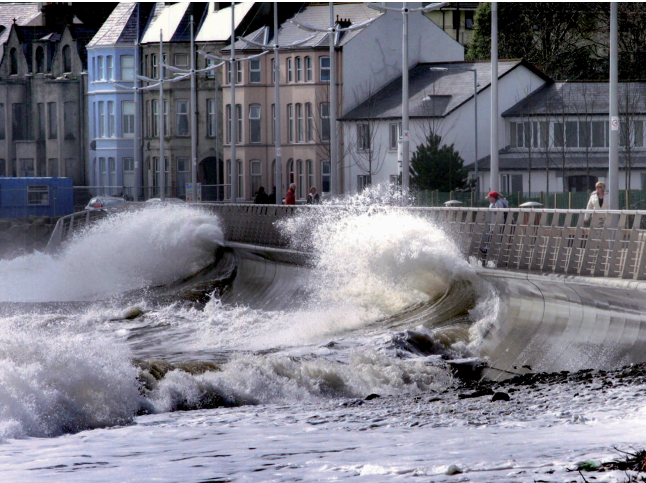
Flood defences at Newcastle, Co Down: well-designed defences will be essential to protect infrastructure and homes against rising sea levels and storm surges. To this end, the Governments of Northern Ireland and the Republic of Ireland must develop and implement coastal protection plans.

'We urgently need a co-ordinated, long-term all-island climate change adaptation plan'