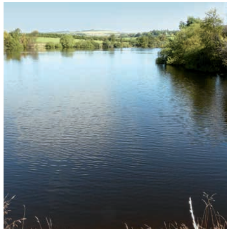
Two views of Vartry Reservoir, Co Wicklow: empty, in a dry October 1990, and full in a wet September 2009. In future, we may have less water when and where we need it.