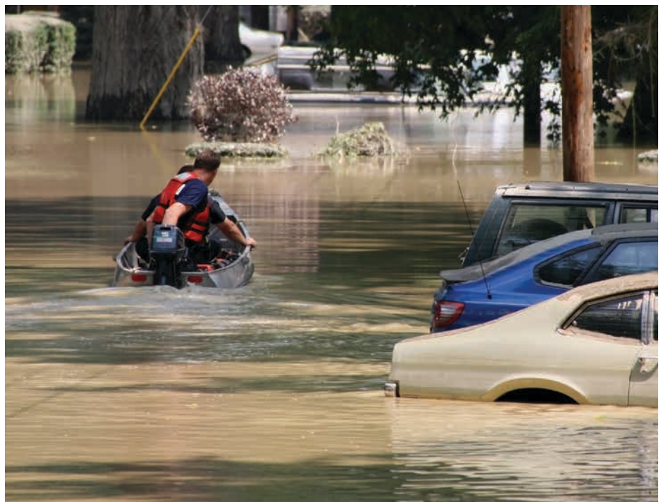
Drainage networks designed and built in the past may not be able to cope with the more frequent and intense rainfall we expect in future.

Traditionally, the design of flood defences was based on historic data, but climate change means design must now take account of future predictions for rainfall, river flows and sea levels. The OPW, which runs a sizeable flood defence programme, already 'climate checks' its designs against two scenarios of climate change, including a possible average sea level rise of one metre. While the standards for newly designed flood defences take climate change into consideration, these allowances are based on current science, and must be reviewed and updated as further research is undertaken.