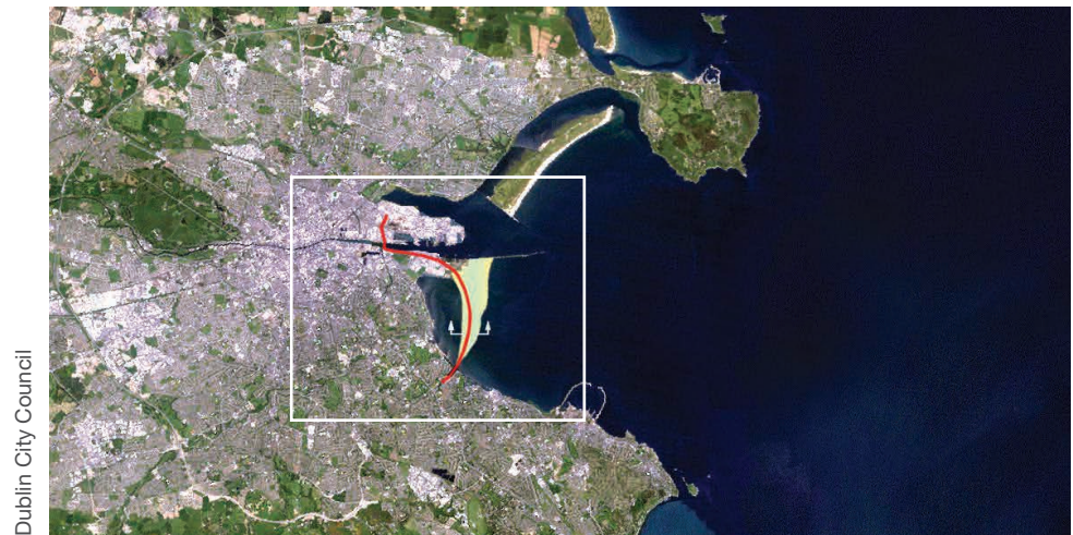
An eastern by-pass option for Dublin: the proposed transport embankment would also protect the vulnerable Ringsend and Sandymount areas against the floods, storms surges and rising sea levels.

network marshalling stations and electricity substations, or the destruction of electricity lines by high winds. Hence the energy sector must address a wide range of adaptation issues, including: